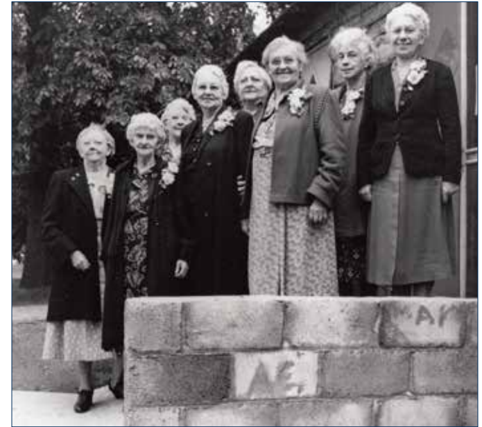
Golden Age campers sport corsages they made at craft class, circa 1950s.