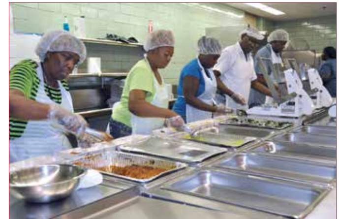
Staff in the home-delivered meal program prepare more than 160,000 meals per year for local seniors.