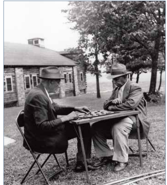
Below: Golden Age campers enjoy some leisure time, circa 1950s.